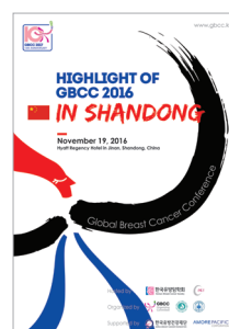
Highlight of GBCC 2016 in Shandong