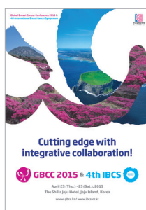
GBCC 2015 & 4th IBCS